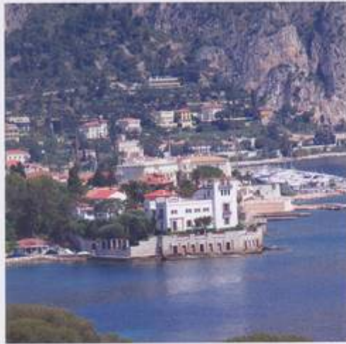
BELOW: Villa Ephrussi